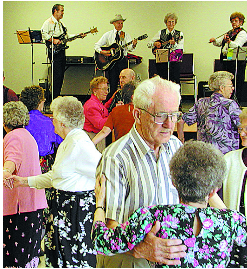
The foundation supports the Branch 109 Seniors Activity Centre and all it offers to the older generation.

The donation of a life insurance policy can be part of an overall financial and planned giving program. If this strategy is of interest to you, discuss it with your financial advisor or life insurance professional.